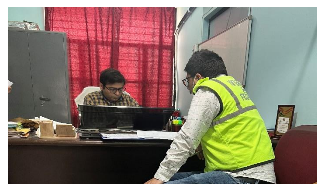
Enumeration in Rohilkhand Medical College & Hospital, Bareilly

Second is to undertake training of able-bodied Bystanders to act as First Responders during pre-hospital care. An IRF-IC team of Pre-hospital Trauma Care Technicians imparted hands on training on First Aid Trauma Care to the Bystanders drawn from road side establishments, communities, institutions, etc. The curriculum covered in the training programme include Cardio Pulmonary Resuscitation (CPR), Splinting, Injuries Management, Management of Animal Bites, Safe Transportation of the victims, etc. On the Project Stretch, 7 Training Programmes were imparted to Bystanders / Workers / Staff at Toll Plazas, Schools, Panchayat Samiti, etc. 365 Bystanders were trained.