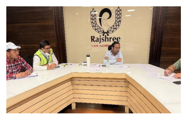
Enumeration in Rajshree Hospital & Medical College, Bareilly

5 <sup>th</sup> E of Emergency Care : The objective of this intervention is three pronged. First, Survey of the Hospitals at District Level, offering more than 100 Beds and having provision for 24-hour emergency, to understand their current available Infrastructure and Skilled Capacities. This will be followed by a feasibility exercise aiming to enhance 5-6 of these hospitals to Level 1/Level 2/Level 3 Trauma Care Centres. IRF-IC team had surveyed 6 hospitals which met our screening criteria and collected data from all of them.