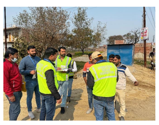
Collecting information of road accidents from nearby villagers

A comprehensive audit report has been prepared giving details of proposed corrections at the Junctions, recommendations on Traffic Signage and Markings and a detailed BoQ submitted to NHAI. The next step is the implementation of the corrections by NHAI to make the stretch Safer.