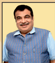
Mr. Nitin Gadkari Hon'ble Union Minister, Ministry of Road Transport and Highways (*Confirmation awaited)