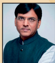
Dr. Mansukh Mandaviya Hon'ble Union Minister, Ministry of Health & Family Welfare (*Confirmation awaited)